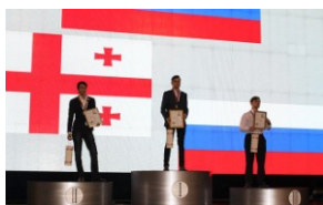
EUROPEAN INDIVIDUAL CHESS CHAMPIONSHIP 2017