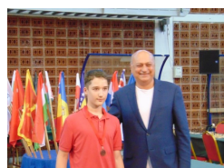
EUROPEAN SCHOOL CHESS CHAMPIONSHIP 2017