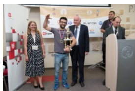
EUROPEAN AMATEUR CHESS CHAMPIONSHIP 2017