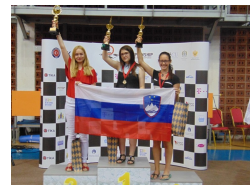
EUROPEAN YOUTH RAPID & BLITZ CHESS CHAMPIONSHIP 2017